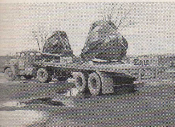
Two model OHF-3's leaving plant for heavy dredging project.

ANY CRANE EQUIPPED TO HANDLE CLAMSHELL BUCKETS CAN HANDLE ERIE ORANGE PEEL BUCKETS AND GRABS