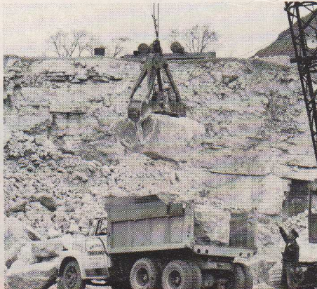
Model ILG-5R loading 7-ton breakwater stone.