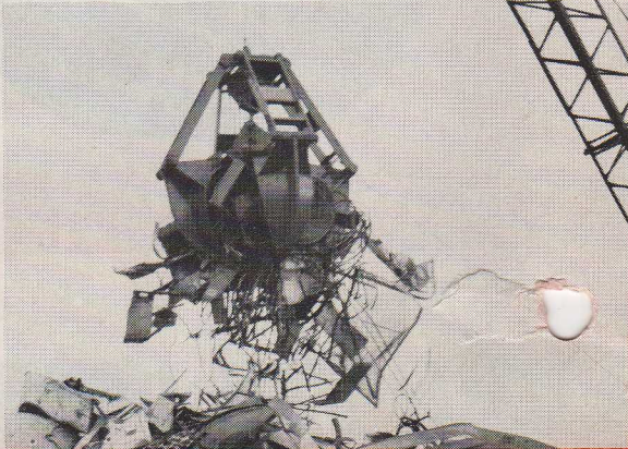
4OLS-1 Unloading light mixed scrap.