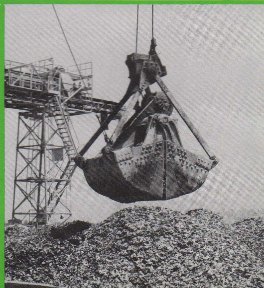
Fig. 25. Blaw-Knox two-line lever arm type wide rehandling bucket. Size No. 7300. Handling oyster shells.